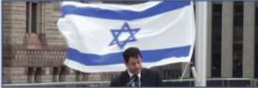
Raising the flag of Israel at Toronto City Hall to celebrate Yom Ha'atzmaut.