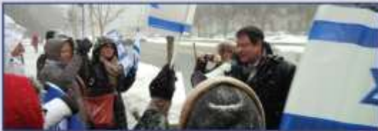
Speaking at a rally in support of Israel and against a nuclear Iran.