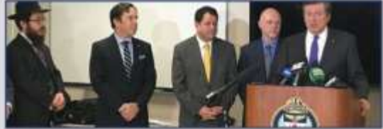
At Toronto Police Service 32 Division condemning anti-Semitic hate crimes in Toronto and Canada.