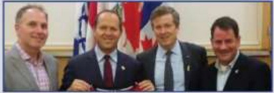
Meeting with the Mayor of Jerusalem as part of the City of Toronto delegation to Israel to build business ties and fight BDS.