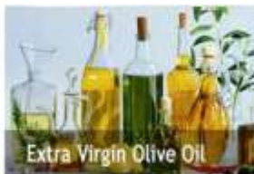
Extra Virgin Olive Oil