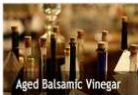
Aged Balsamic Vinegar